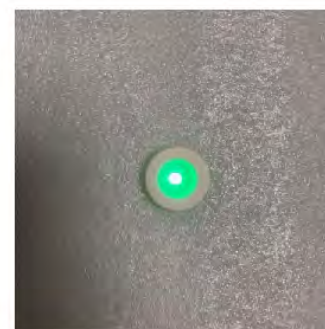
High Brightness Remote LED Emergency Indicator

For emergency version, add onto end of part number as required