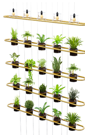
Løkken - Wall