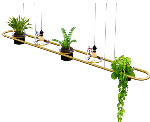
Løkken - Planter