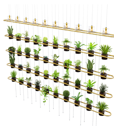
Løkken - Partition