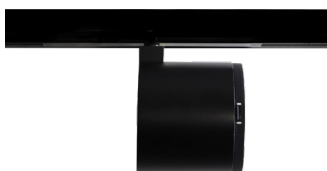
Lega 80 Track Spot