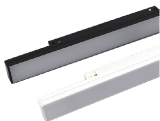
Lega LED Linear