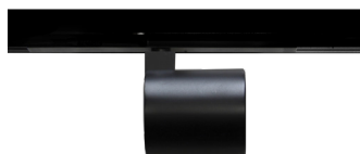
Lega 50 Track Spot