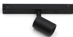
Lega 25 Track Spot