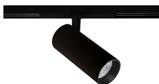
Lega N Track Spot