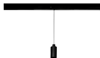
Lega 25 Pendant