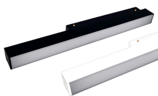
Lega LED Linear 2