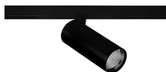
Lega S Track Spot