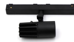
Lega Colus Track Spot