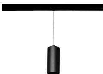
Lega 50 Pendant