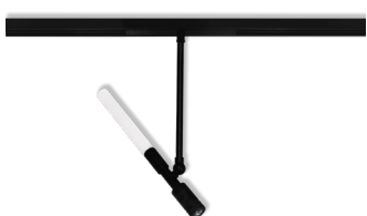
Lega Visus Batton and Spot