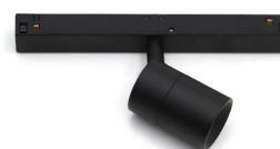
Lega 35 Track Spot