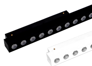
Lega LED Linear Spots