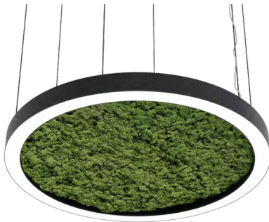
Ring - MOSS