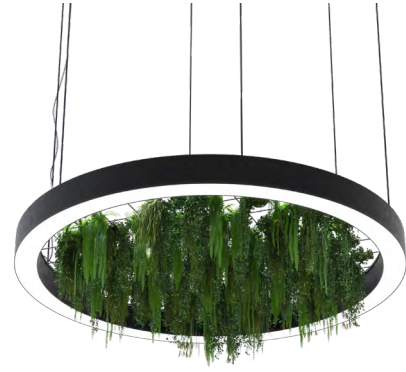
Ring - MESH