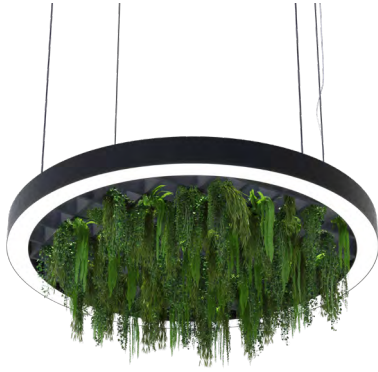
Ring - GRID