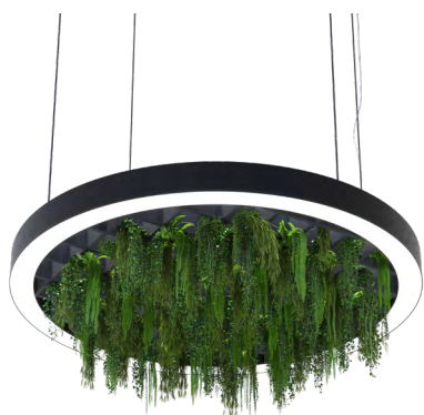
Ring - GRID