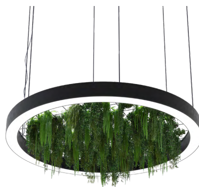
Ring - MESH