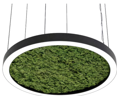
Ring - MOSS