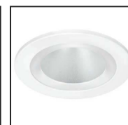
TRX/BEZ/HL/F Frosted hi-light ring. Requires bezel