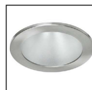
TRX/BEZ/BA Brushed Aluminium bezel