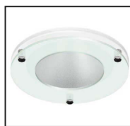
TRX/BEZ/HDG Halo Drop Glass on white bezel