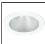
TRX/BEZ/BW Brilliant white RAL 9016 bezel