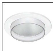
TRX/BEZ/VH Frosted vertical ring. Requires bezel