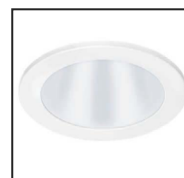
TRX/BEZ/IP54/OP IP54 Opal polycarbonate. Requires bezel