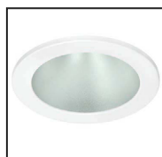
TRX/BEZ/IP54/CG IP54 Clear Glass. Requires bezel