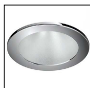
TRX/BEZ/CH Chrome bezel